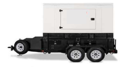
200kW Mobile Generator $POA