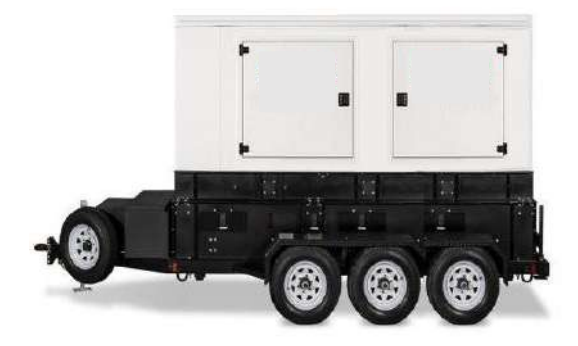
250kW Mobile Generator $POA